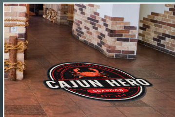
ColorStar® Impressions HD Custom Shape