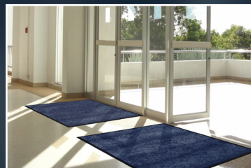
ColorStar® (PET fabric features 100% recycled content reclaimed from plastics)

By preventing contaminants from entering a facility, mats will substantially reduce the need for cleaning chemicals that might be harmful to building occupants and the environment. M+A is committed to developing and manufacturing eco-friendly products, reusing and recycling materials as often as possible.