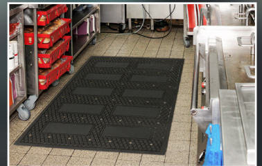
Traction Tread Grit