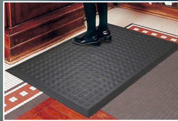
Complete Comfort™ II

Prolonged standing puts pressure on the feet, leg muscles, spine, neck, and shoulders which can lead to chronic pain, injuries, and muscular disorders. By providing employees with anti-fatigue mats in standing areas, it can increase productivity and reduce the pain associated with standing for long periods of time. Standing on an anti-fatigue mat burns calories, reduces energy consumption, alleviates stress to the back and legs, and also reduces fatigue as a whole.